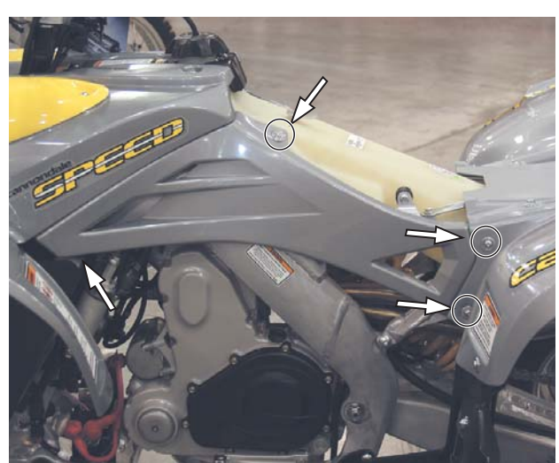
Left side panel

Make sure the engine and exhaust system are completely cool. Remove the key from the ignition switch, main fuse, and seat. Remove the left side panel bolts and top hats and carefully slide the panel down and out from between the front fender and rear fender panels.